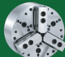
Dual Lock Chuck DL200 series