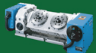
Two-axis Tilting NC Rotary Table TW2180