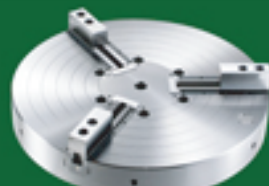
Large Power Chuck for Vertical Lathe NV series