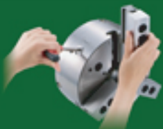
Quick Jaw Change Chuck QJR series