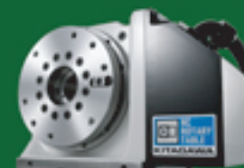
High Clamping Torque NC Rotary Table GT series